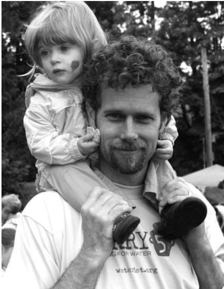
my brother-in-law and niece.